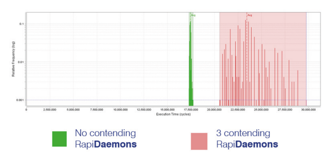
Understand multicore interference and predictability

Rapi Daemons allow you to provide the evidence to identify interference channels and quantify interference effects for multicore systems.