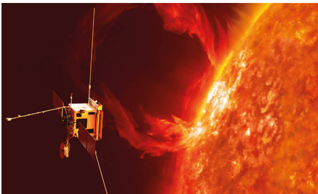
Figure 1 – The Solar Orbiter

The project chose RVS to perform the on-target worst-case execution analysis. Apart from analysing the worst-case execution time (WCET), RVS could also measure code coverage in compliance with ESA's ECSS-E-40C standard, in addition to ISO 26262 and DO-178B guidelines.