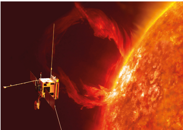
Figure 1: The Solar Orbiter

The University of Alcalá, the developers of the onboard software for the Instrument Control Unit (ICU) of the EPD, selected Rapita Verification Suite (RVS) to support schedulability analysis for the ICU software.