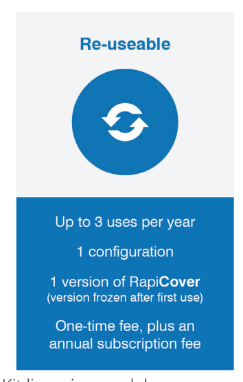
Figure 1: Qualification Kit licensing models