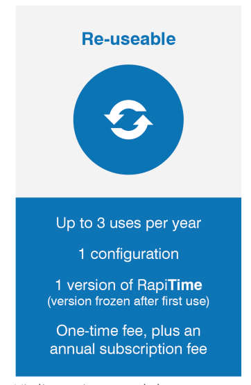
Figure 1: Qualification Kit licensing models