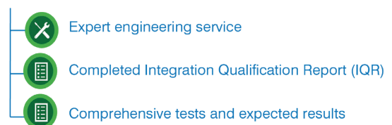
Figure 2: Qualified Target Integration Service

Combined with the documentation provided in our Qualification Kits, the materials generated during the Qualified Target Integration Service complete the evidence you need for tool qualification.