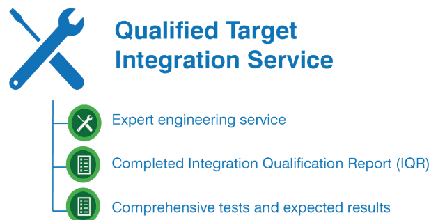
Figure 2: Qualified Target Integration Service

Our Qualified Target Integration Service is delivered by Rapita Field Application and Software Quality Assurance experts, and includes comprehensive reporting, tests and expected results demonstrating that the integration works correctly.