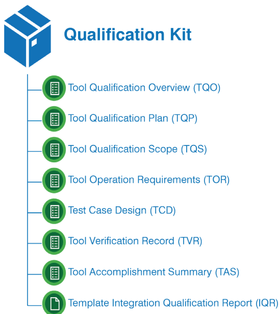
Figure 1: Qualification Kit

A Qualification Kit is a comprehensive documentation package that provides evidence that RapiTest meets the guidance given in DO-330 for commercial off-the-shelf (COTS) products.