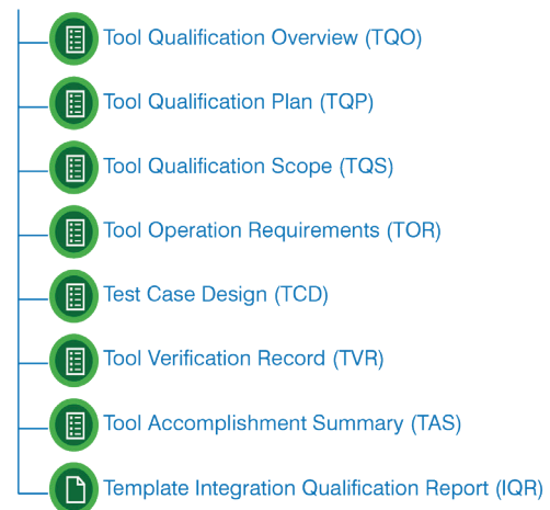
Figure 1: Qualification Kit document templates