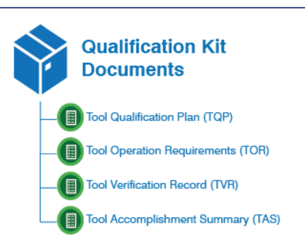
Figure 1. Qualification Kit document templates

The documentation and processes we use to produce our Rapi Daemons Qualification Kits follow the guidance in DO-330 for a TQL-5 COTS tool. DO-330 complements DO-178C by providing specific guidance for tool qualification, and defines Tool Qualification Levels (TQL) 1-5.